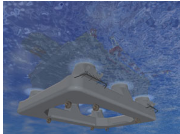
The Exmar 2500 Fish-Eye View